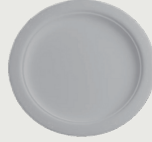
P-0700 [Round Plate 7"]

Size (mm) : 155x15mm Pcs/Ctn : 1000 Weight (g) : 7 Ctn Size (mm) : 340x330x343mm Color :