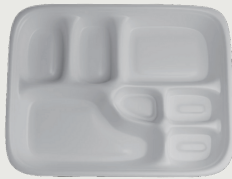
LBT-0701 [7 Compartment Bento Box]

Size (mm) : 264 x 205 x 43mm Pcs/Ctn : 500 Weight (g) : 28 Ctn Size (mm) : 540 x 360 x 425mm Color :