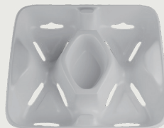
CH-0401 [4 Cup Holders]

Size (mm) : 195 x 107 x 45mm Pcs/Ctn : 600 Weight (g) : 13 Ctn Size (mm) : 620 x 410 x 235mm Color :