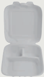
C-0903 [3-Comp 9" Clamshell]

Size (mm) : 477*232*51mm Pcs/Ctn : 200 Weight (g) : 45 Ctn Size (mm) : 500*480*300mm Color :