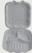
C-8503 [3-Comp 8.5" Clamshell]

Size (mm) : 420x204x49mm Pcs/Ctn : 200 Weight (g) : 38 Ctn Size (mm) : 480x440x220mm Color :