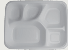
LBT-0501 [Large 5 Compartment Bento Box]

Size (mm) : 261x211x24mm Pcs/Ctn : 500 Weight (g) : 20 Ctn Size (mm) : 470X285X450mm Color :