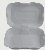
C-0906 [9" x 6" Hamburger Box]

Size (mm) : 308x150x46.6mm Pcs/Ctn : 500 Weight (g) : 21 Ctn Size (mm) : 565x335x335mm Color :