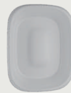
SB-32 [32oz Salad bowl ]

Size (mm) : 230*180*10mm Pcs/Ctn : 400 Weight (g) : 20 Ctn Size (mm) : 580*250*380mm Color :