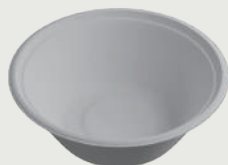
B500 [500 Bowl]

Size (mm) : 142x56.5mm Pcs/Ctn : 1000 Weight (g) : 12 Ctn Size (mm) : 740x335x310mm