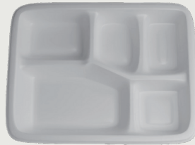
BT-0501 [5 Compartment Bento Box]

Size (mm) : 265 x 204 x 43mm Pcs/Ctn : 500 Weight (g) : 28 Ctn Size (mm) : 540 x 360 x 425mm Color :