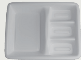
BT-0401 [4 Compartment Bento Box]

Size (mm) : 227 x 178 x 30mm Pcs/Ctn : 800 Weight (g) : 20 Ctn Size (mm) : 630 x 470 x 375mm Color :