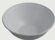
B250 [250 Bowl]

Size (mm) : 115x45mm Pcs/Ctn : 1000 Weight (g) : 6 Ctn Size (mm) : 480x360x257mm