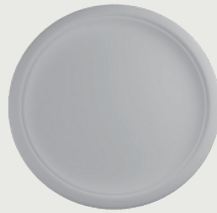
P-1000 [Round Plate 10"]

Size (mm) : 226x19.6mm Pcs/Ctn : 500 Weight (g) : 15 Ctn Size (mm) : 470x370x250mm Color :