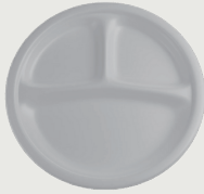
P-0903 [3-Com Round Plate 9"]

Size (mm) : 226x19.6mm Pcs/Ctn : 500 Weight (g) : 15 Ctn Size (mm) : 470x370x250mm Color :