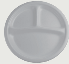
P-1003 [3-Com Round Plate 10"]

Size (mm) : 259x19.6mm Pcs/Ctn : 500 Weight (g) : 21 Ctn Size (mm) : 535x400x280mm Color :