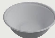
B350 [350 Bowl]

Size (mm) : 138x45.5mm Pcs/Ctn : 1000 Weight (g) : 9 Ctn Size (mm) : 720x300x295mm