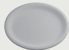
O-1310 [Big Oval Plate]

Size (mm) : 264x200x20mm Pcs/Ctn : 500 Weight (g) : 17 Ctn Size (mm) : 370x280x410mm Color :