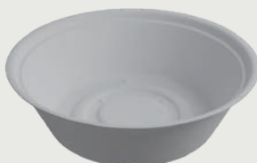
B850 [850 Bowl]

Size (mm) : 178x50mm Pcs/Ctn : 600 Weight (g) : 17 Ctn Size (mm) : 553x388x389mm