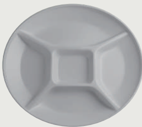
P-1005 [10"5 Compartment School Tray]

Size (mm) : 550x280x543mm Pcs/Ctn : 500 Weight (g) : 25 Ctn Size (mm) : 535x400x280mm Color :