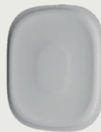
SB-32 (L) [Fiber lid for 32oz Salad ]

Size (mm) : 550x280x543mm Pcs/Ctn : 500 Weight (g) : 25 Ctn Size (mm) : 535x400x280mm Color :