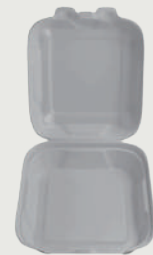
C-0900 [9" Clamshell]

Size (mm) : 420x204x49mm Pcs/Ctn : 200 Weight (g) : 38 Ctn Size (mm) : 480x440x220mm Color :