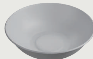
B29oz [29 oz Bowl]

Size (mm) : 172x59mm Pcs/Ctn : 400 Weight (g) : 17 Ctn Size (mm) : 405x370x370mm