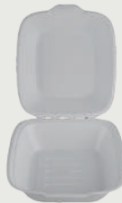
C-0600 [6" Hamburger Box]

Size (mm) : 477*232*51mm Pcs/Ctn : 200 Weight (g) : 45 Ctn Size (mm) : 500*480*300mm Color :