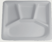
T-0401 [4-comp Meal Tray]

Size (mm) : 225x185x20mm Pcs/Ctn : 500 Weight (g) : 15 Ctn Size (mm) : 450x393x242mm Color :