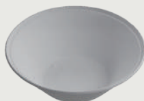
B300 [300 Bowl]

Size (mm) : 125x45.6mm Pcs/Ctn : 2400 Weight (g) : 8 Ctn Size (mm) : 475x405x520mm