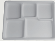
T-0501 [ 5-comp Big Meal Tray ]

Size (mm) : 225x185x20mm Pcs/Ctn : 500 Weight (g) : 15 Ctn Size (mm) : 450x393x242mm Color :